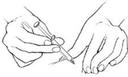
Picture 3 Pinching the skin and injecting the medicine at a 45-degree angle.